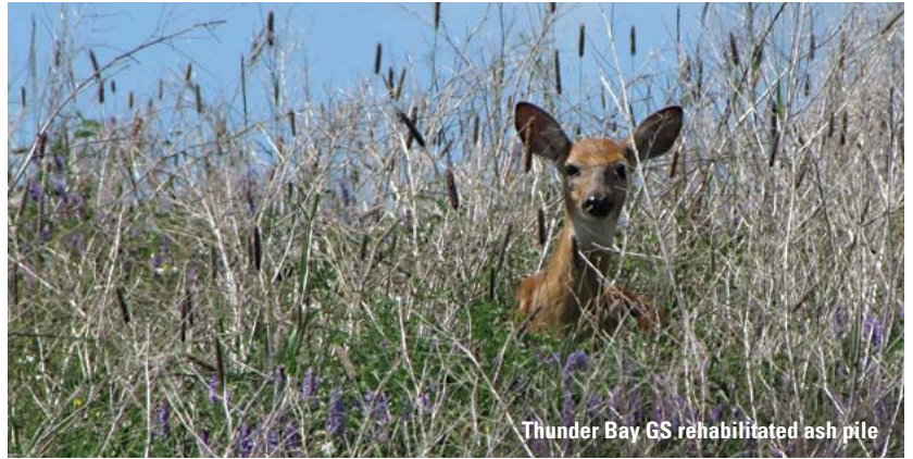
Thunder Bay GS rehabilitated ash pile