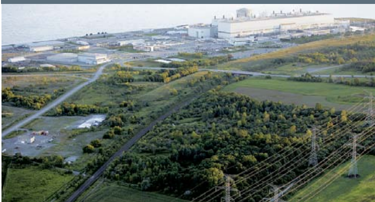
Darlington New Nuclear Site

Following the federal government’s approval of the Darlington New Nuclear Project Environmental Assessment in May, the Canadian Nuclear Safety Commission (CNSC) Joint Review Panel, announced its decision to issue the Licence to Prepare Site for the project. This is the first of three licences required in the preparation, construction and operation of new nuclear reactors. It is the first licence for new nuclear in over a quarter century. A decision on whether to move forward with the two potential nuclear reactors will be made by the Government of Ontario.