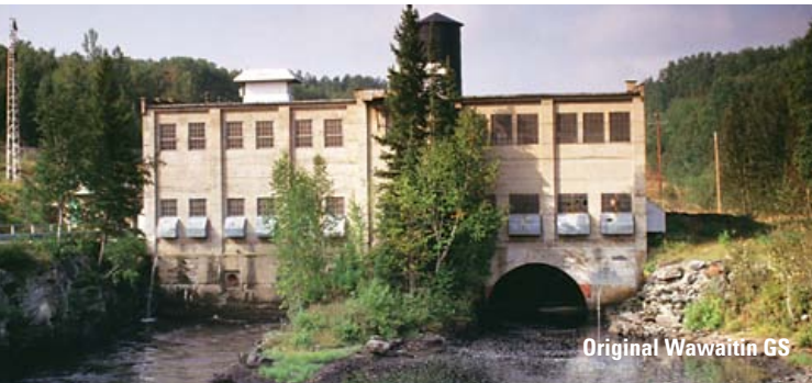
Original Wawaitein GS